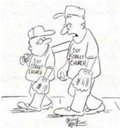
"Remember son, tonight we're playing legalists. There is no mercy rule."