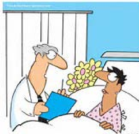
"Please don't pray for healing. If it works, your insurance won't know who to reimburse and it messes up our accounting system."