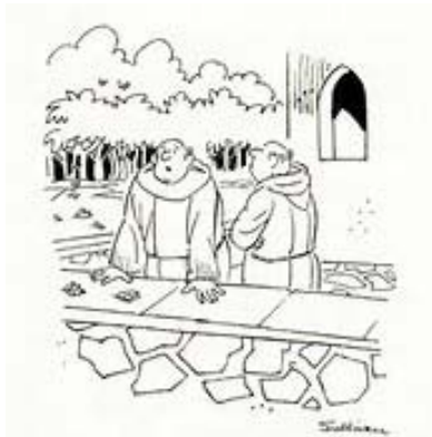
"Year after year they came, descending on me like great hordes of locusts, until I couldn't take it any longer and I had to escape. I can still hear their voices — 'trick or treat, trick or treat.'"