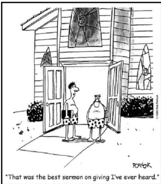
"That was the best sermon on giving I've ever heard."