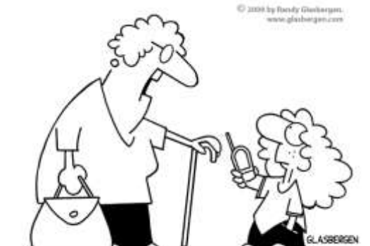
"Wireless communication is nothing new. I've been praying for 75 years!"