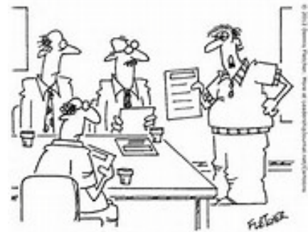
"How am I supposed to transform the youth group into spiritually mature believers when you cut my soda and sugary snack budget in half?"

THERE! THAT OUGHT TO DISPEL THE MYTH THAT WE'RE AN ELDERLY CONGREGATION THAT DOESN'T KNOW HOW TO REACH OUT TO YOUNG PEOPLE.