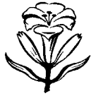
St. Mary the Virgin Mother of our Lord Jesus Christ

The Transfiguration of our Lord Jesus Christ