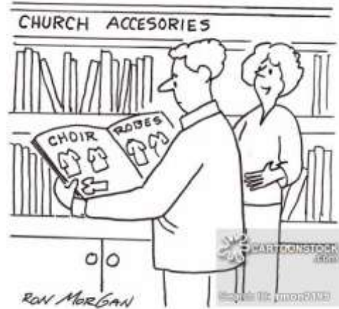
"Never mind the colors. The only one thing they worry about is - does it make them look fat!"