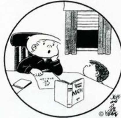
"The Bible tells us to study math. It says, 'Go forth and multiply.'"