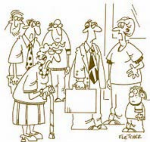
"I thought we agreed that you'd stop bringing your church problems home with you."