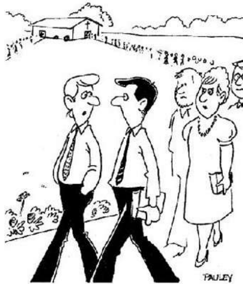
"That was our contemporary service, followed by a traditional service, followed by a classical service, and a casual service with a sports emphasis."