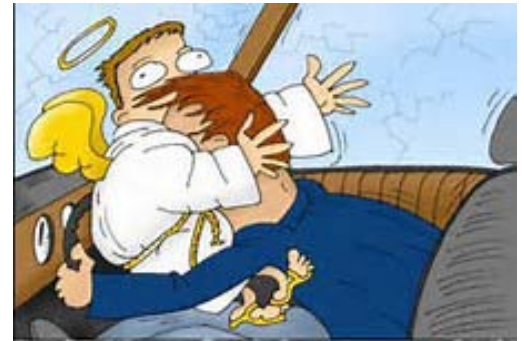
THINGS EASED UP ON GUARDIAN ANGELS AFTER AIR BAGS WERE INVENTED