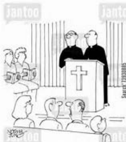
"Oh, oh! They're going to give it to us with both barrels!"